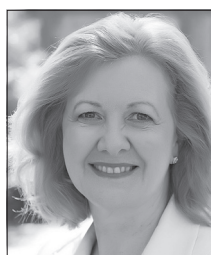
Victoria Borwick MP

Contributing Editor Antiques Trade Gazette